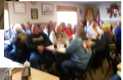
Snaps of September 2012

nor laughed so much. Thanks to all of you in the GWRRA family. WE HAD FUN!!!