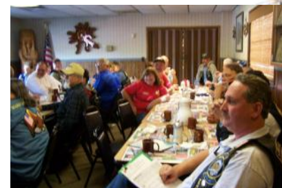
Peanut Butter Festival