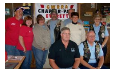
Full House at Chapter W